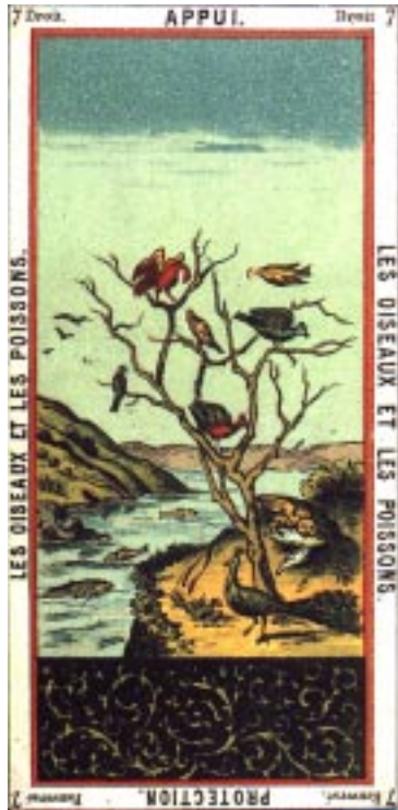
"THE BIRDS AND THE FISHES" AKA EMPRESS ETTEILLAS DECK