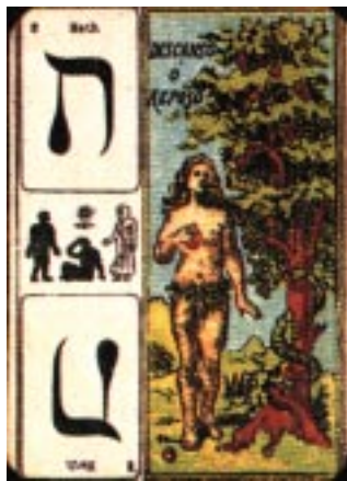
EVE CATALAN DECK

It seems that Etteilla was attempting to realign the images of the Major Arcana with a Greek creation story, a later, Alexandrian modification of the ancient Hebrew mythos of middle-eastern